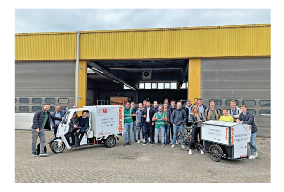
Living Lab HRCargo with the TukTuk ( left ) and the E-cargo Bike L ( right ).

The E-cargo Bike L is an electric cargo bike that has several purposes. There are versions for people with children in the form of a Family and a Shorty version, but also a Cargo and Tender version is available to deliver goods. The E-cargo Bike L has a maximum load capacity of 200 kgs and a volume of 1,000 litres. It has an action radius of 70 kilometres and recharging time of 5 hours. The maximum speed is 25 kilometres/hour. Figure 1 (right vehicle) shows the E-cargo Bike L Cargo version.